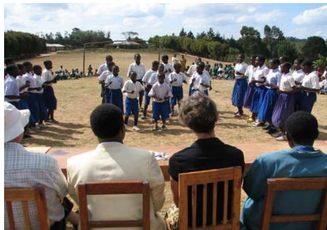
Igoda Primary School children entertain visitors. Oct 2006