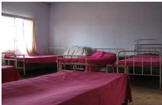
Mdadulo Mission Hospital. Clean and neat. Supposed to service 37,000 people, but is now severely under-used due to lack of staff, equipment, and medicines. October 2006