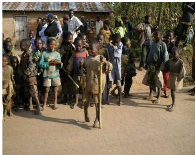
ABOVE: The "Wonder Boy" from the last issue entertains a mix of orphans and other children in Igoda. October 2006