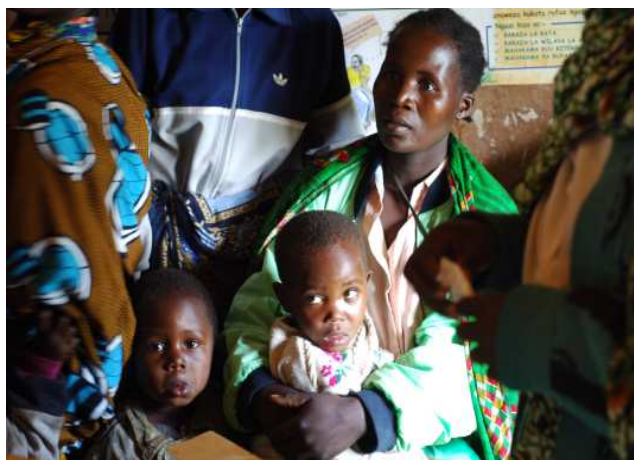
ABOVE: Mothers and children at the Clinic for immunization - October 2006