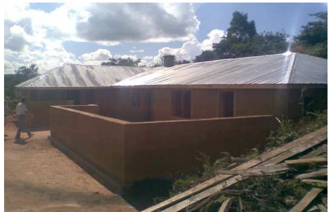
TOP: Two dormitories undergoing the final stages of construction - Jan 07