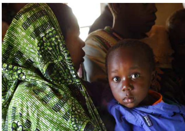
ABOVE: Big eyes are common when young children face the Doctor. All too often Igoda Clinic visits are followed by sudden death from AIDS. - October 2006