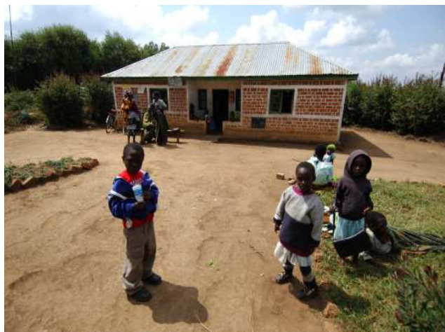
ABOVE: Igoda Medical Clinic with children waiting to be immunized for polio, measles or TB - August 2006.