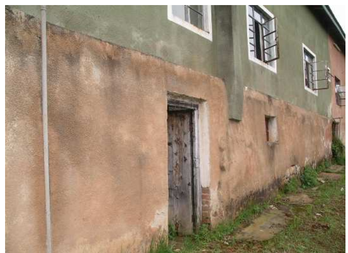
TOP: Mdbulo Hospital showing the need for major repairs before putting it back in service for HIV/AIDS victims - May 07