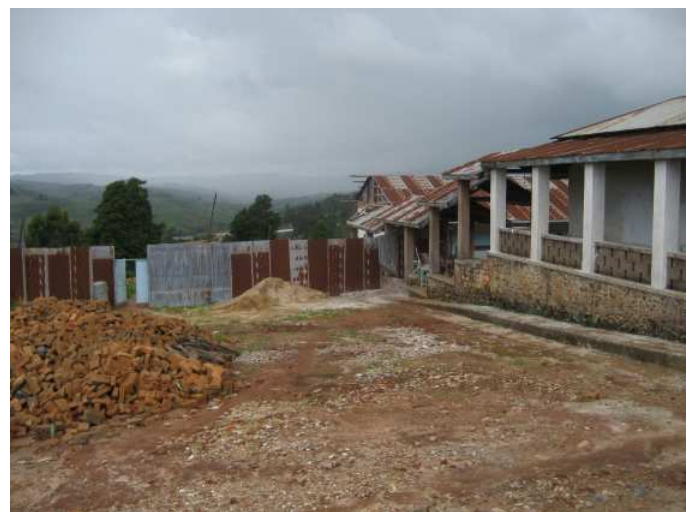
ABOVE: A wing of the Mbabulo Hospital showing the old ward to be demolished, (right-rear), on-going construction (left-rear), and the new laboratory building yet to be furnished and staffed. (right-foreground) . - February 2008